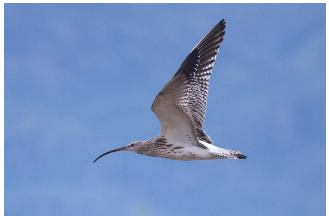
Eurasian Curlew

One photographed at Kemurara Bay, Matusadona NP, Lake Kariba, (1628D1) on 12 January 2021; D & P Dell.