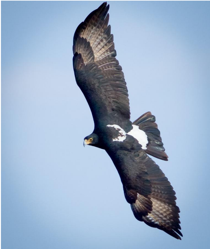
Verreaux's Eagle

The 2023 season marked the 60 th consecutive year of formal reporting on the breeding of the Verreaux's Eagle (Black Eagle) Aquila verreauxii in the Matobo National Park. To mark this auspicious occasion, a successful celebratory weekend took place in mid-July, drawing participants from near and far. Participants were treated to various informative presentations as well as having an enjoyable day out in the field, observing some