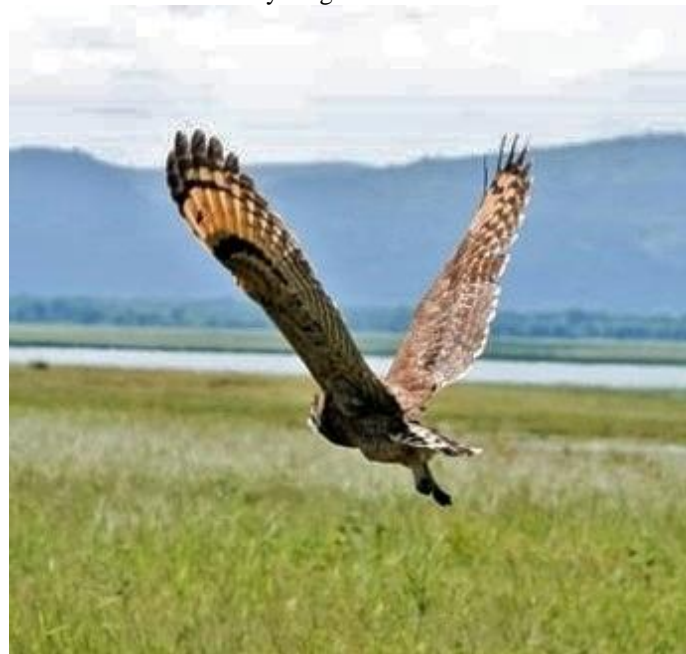
Figure 2. A Marsh Owl on grassland at Lake Kariba.

An African Wood-owl Strix woodfordii was heard in a Newlands garden on 1 and 17 April (IR). Two Marsh Owls Asio capensis were on Kennedy vlei, Hwange NP (1827 C3†), on 28 January (JV) and a scarce Lake Kariba record was one that was photographed on Tsetse Island (1628 D2†) on 5 February (RDy). A Pel's Fishing-owl Scotopelia peli at Mavuradonha Wilderness (1631 A3†) between 8-12 April (RC) was west of the main Zambezi Valley range.