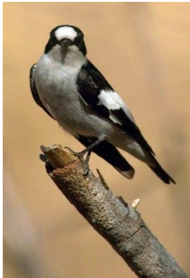
Figure 3. The Collared Flycatcher recorded at Mabale Village, near Hwange main Camp.

Anchieta's Tchagras Bocagia minuta are sparse within their restricted range on the eastern border so a report that numbers are increasing on vleis on Katiyo Estate (1833 A3) (MS) is good news indeed. Similarly confined to a very small border area, a Bokmakierie Telophorus zeylonus was at Bailey's Folly, Chimanmani Mountains (1933 C3), on 22 May (TO per J-MB). A highveld Retz's Helmet-shrike Prionops retzii record came from Lake Chivero on 17 April (PM).