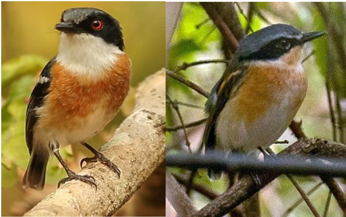
Figure 1. Woodward's Batis; Male (left) and female (right).