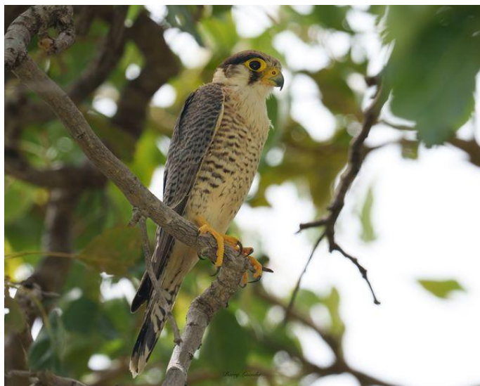
Red-necked Falcon photo © B. Launder

One photographed at Fothergill, Kariba (1628D1) on 14 March 2023; B. Launder (Facebook).