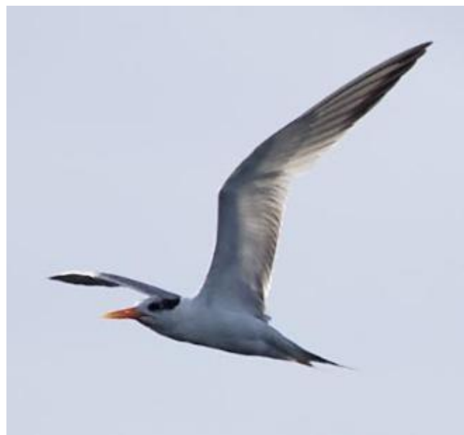
Figure 1. West African Crested Tern.

(SE et al. ). It was reported in South Africa by a visitor from there but was apparently not logged in Zimbabwe. ( Editor's note: This species breeds along the West African coast from Mauretania to Guinea, and winters as far south as Namibia).