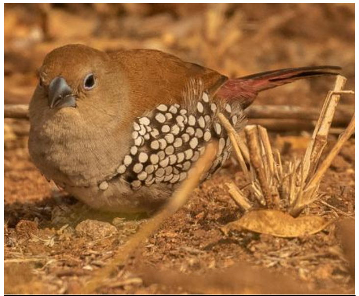
Figure 1. Pink-throated Twinspots at Swimuwini Camp, Gonarezhou National Park, male (left), female (right).