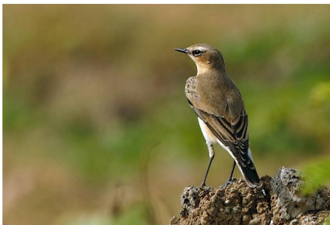
Northern Wheatear

One photographed at Westwood Vlei, Matetsi (1725C4) on 3 November 2016; D. Dell (Facebook, SA Rare Bird News Report – 07 November 2016).