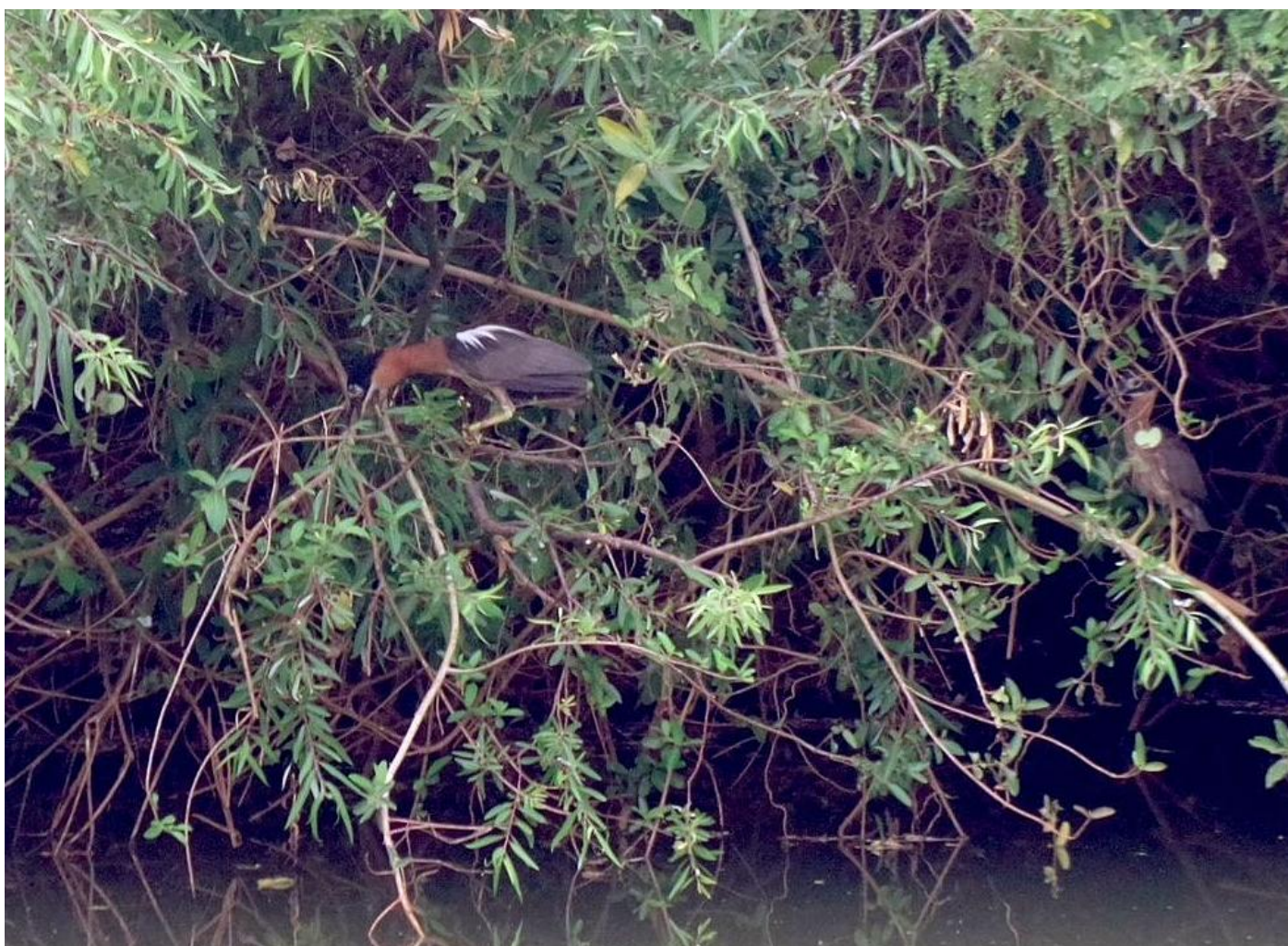
White-backed Night-herons displaying and calling, photo © F. Nyandeni