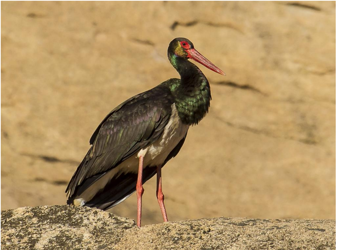
Black Stork Ciconia nigra

Journal of Zimbabwean and Regional Ornithology December 2023, Volume 69, Part 2